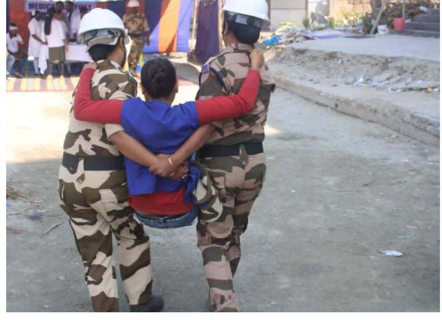
Rescue of victims by CISF team in Vishal Mega Mart mall