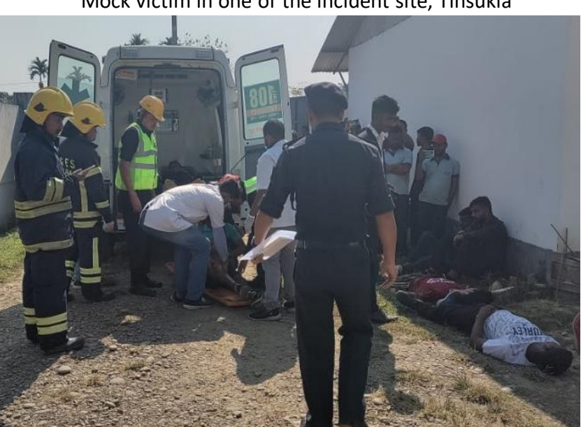
Transfer of victims to hospitals, Tinsukia