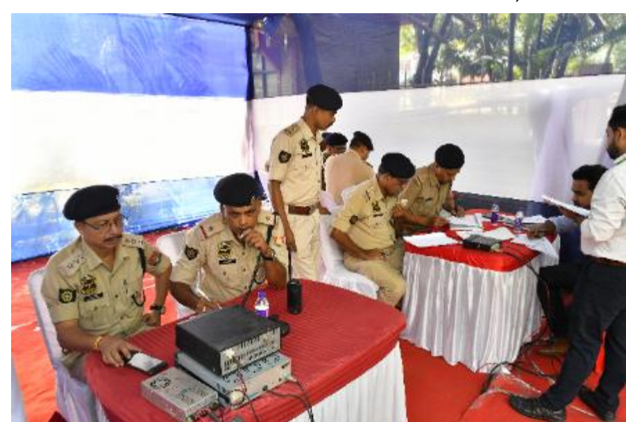
Assam Poll@e1Radlo2 Organization (APRO) communication hub outside the SEOC for collating information from districts