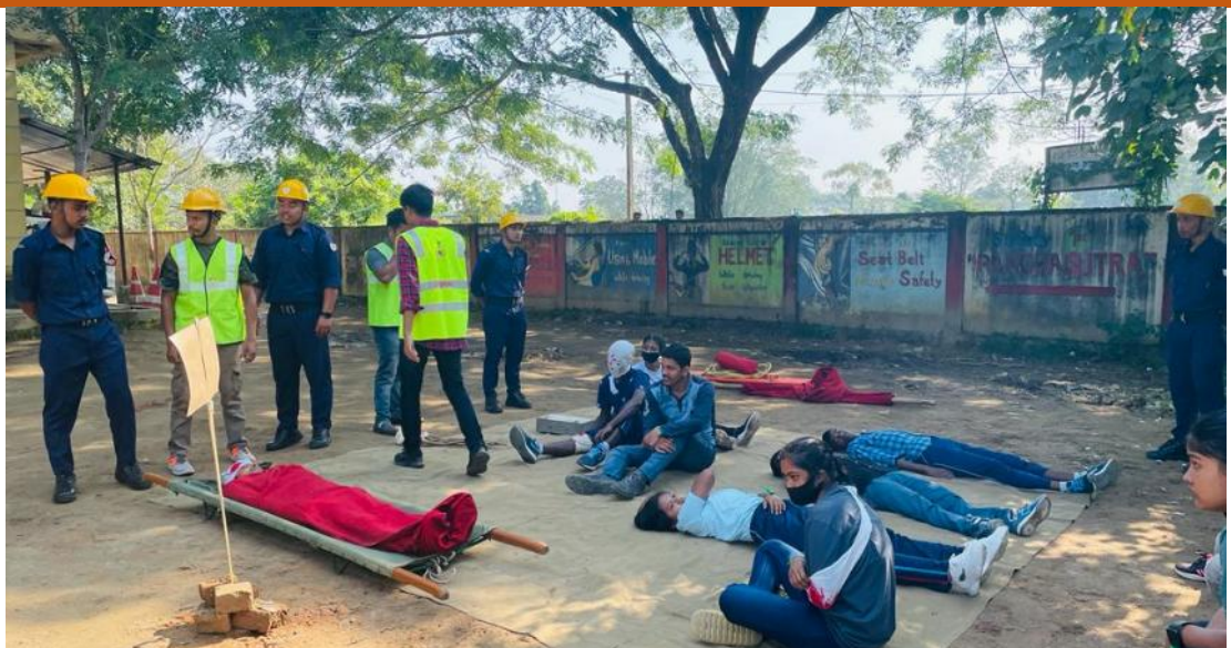
Triage near the affected site, Tinsukia