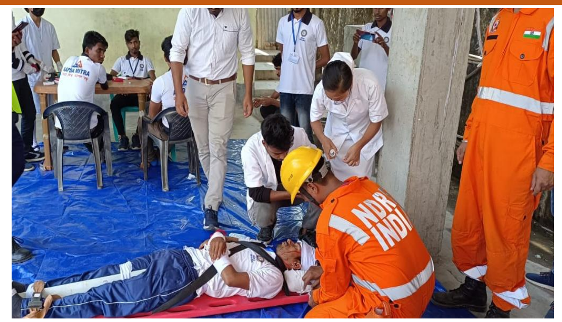
Operation Section in action at EOC during the Mock exercise