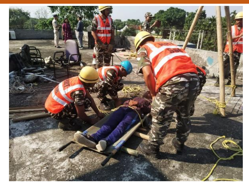
SSB unit rescuing victims from one site in Chirang