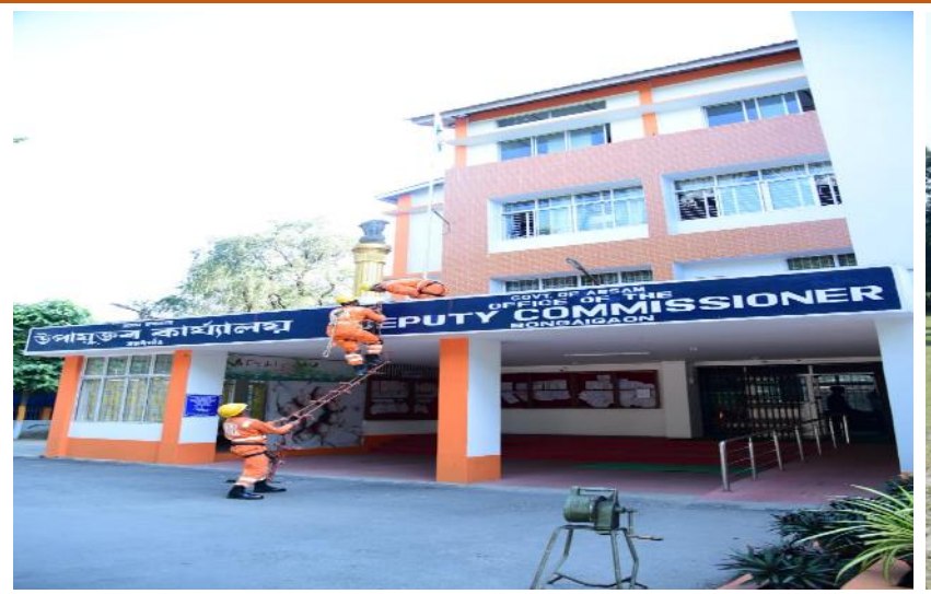
Deputy Commissioner's office building collapse scenario