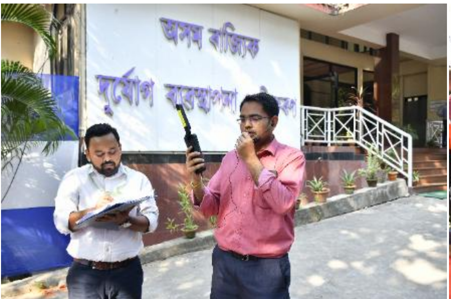
Satellite phones with ASDMA were also used to establish communication with affected districts