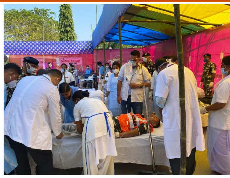
Medical Aid post