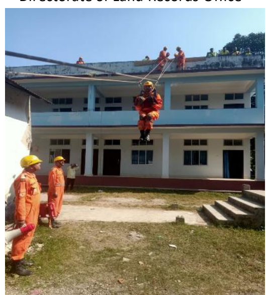
Directorate of Land Records Office