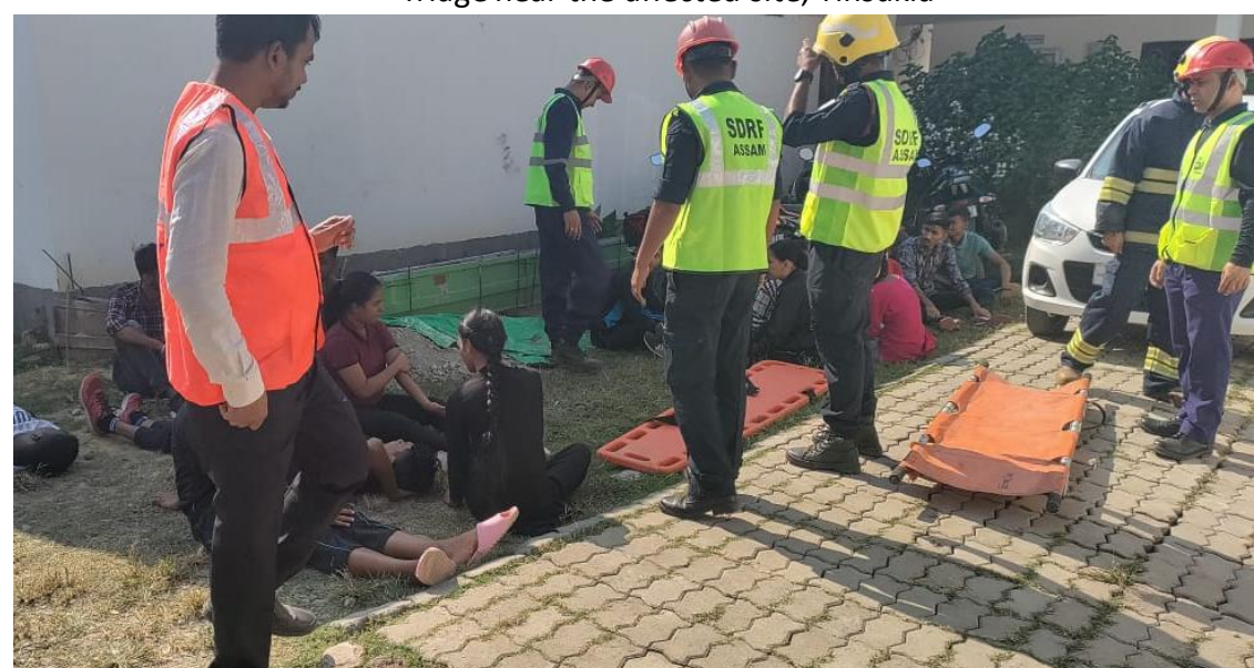
SDRF Team responding incident site under the Industrial Area, Borguri, Tinsukia