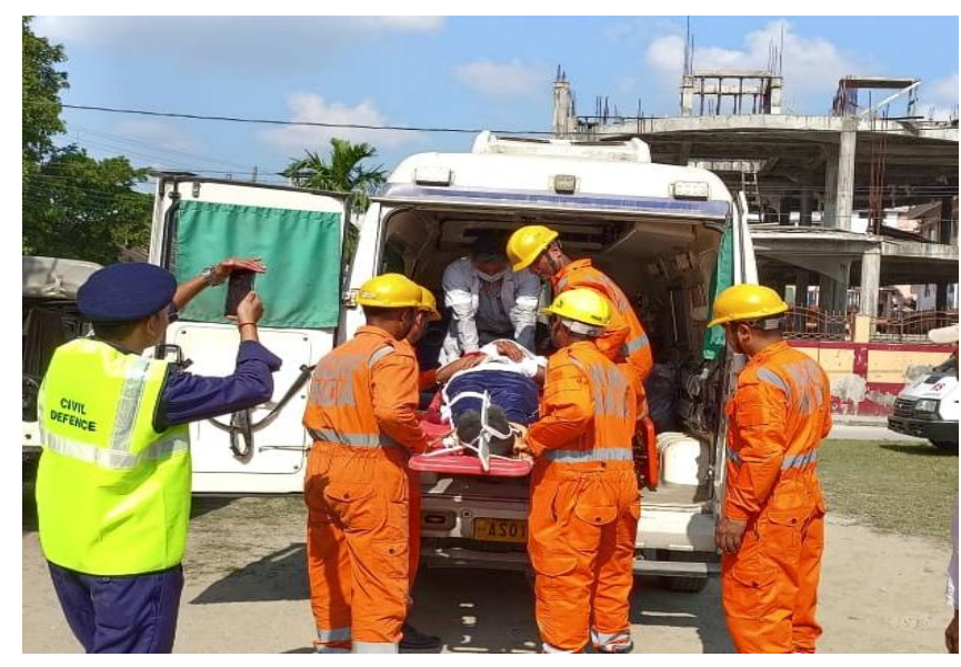
Transfer of mock victims from Directorate of Land Records Office to RNB Civil Hospital