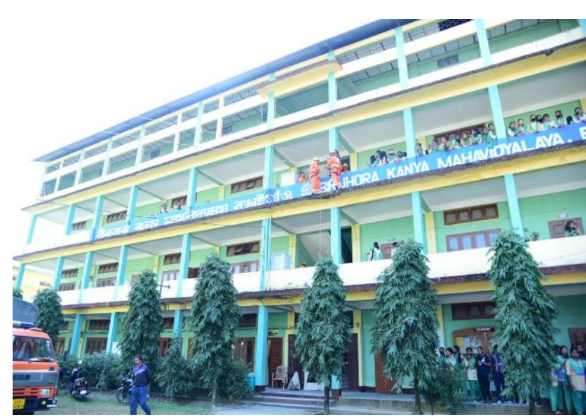
Rescue operation by 1<sup>st</sup> Bn. NDRF in Birjhora Kanya Mahavidyalaya, Bongaigaon