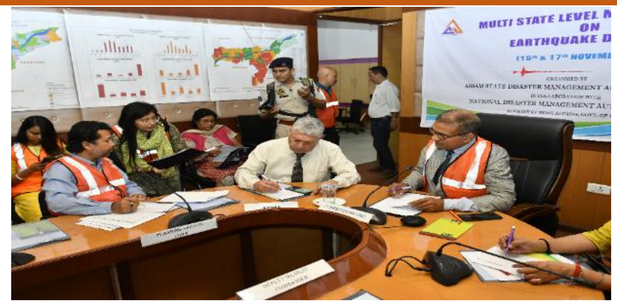
Incident Commander, state IRT taking stock of the situation with state level IRT members at SEOC during the mock exercise