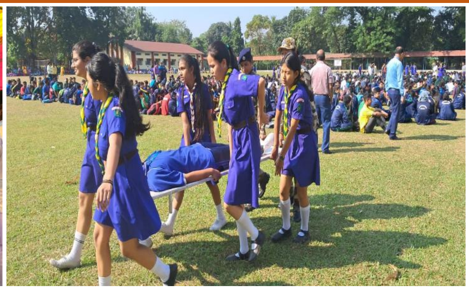
Scout & Guide volunteers responding to school building damage site