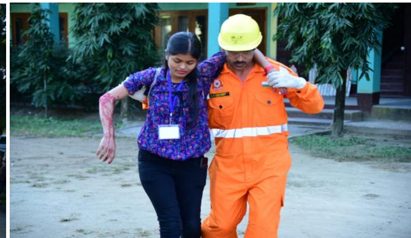
Rescue of building collapse victims by 1st Bn. NDRF