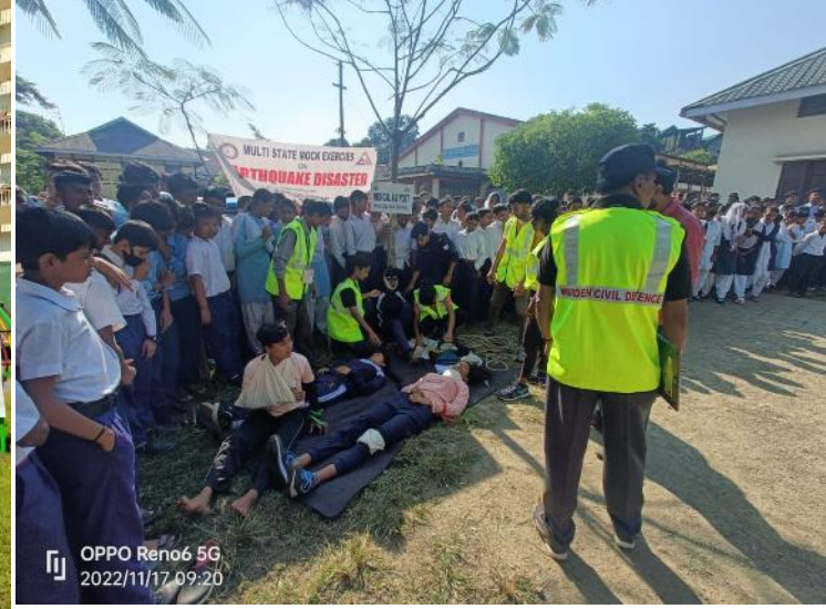
Triage in the Sivasagar Govt. Higher Secondary School by the Civil Defence volunteers lead by the local Warden