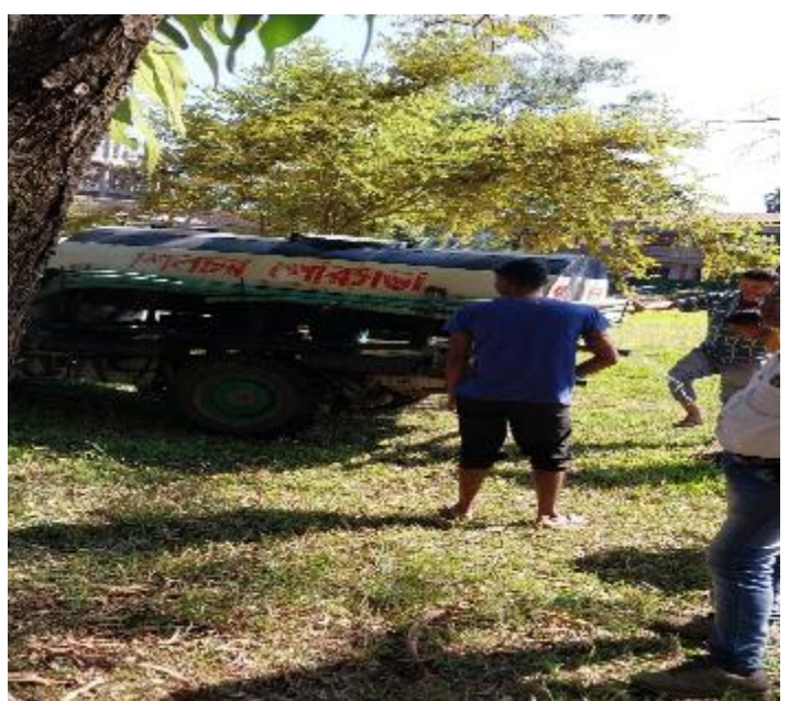
Water distribution in relief camp by PHE & Silchar Municipality Board