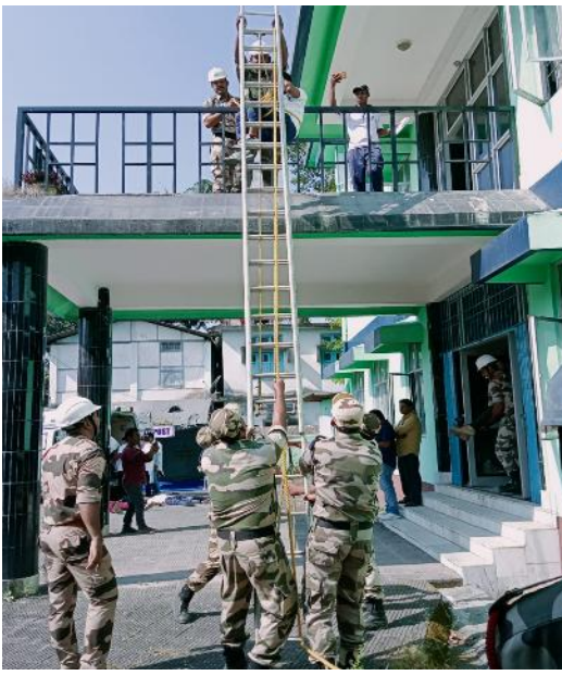
Directorate of Land Records Office