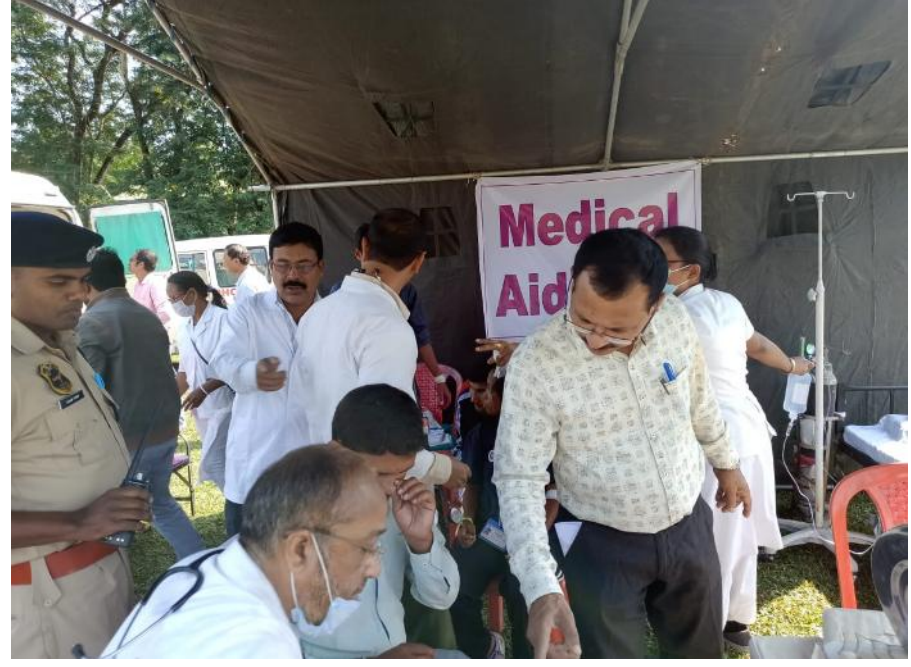
A view of the Medical Aid Post, Bongaigaon \begin{tabular}{l} \end{tabular}