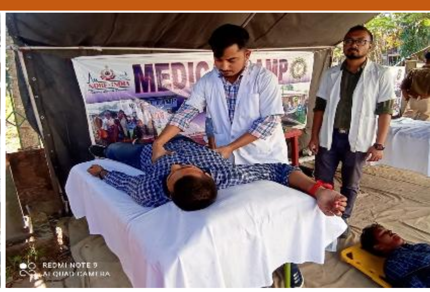
Medical Aid Post outside SMCH