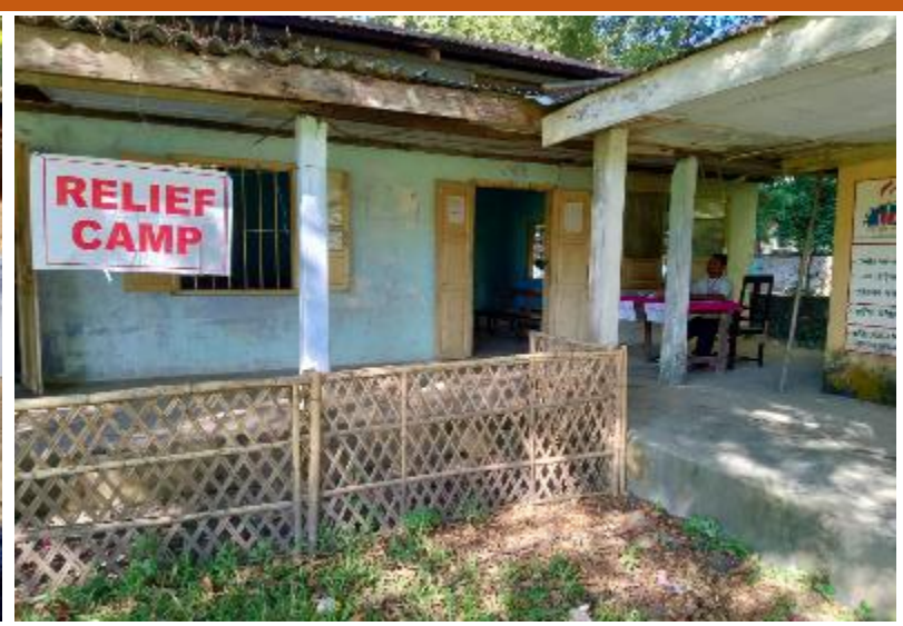
Relief camp established in Deshbakhta Tarun Ram Phukan High School, Silchar