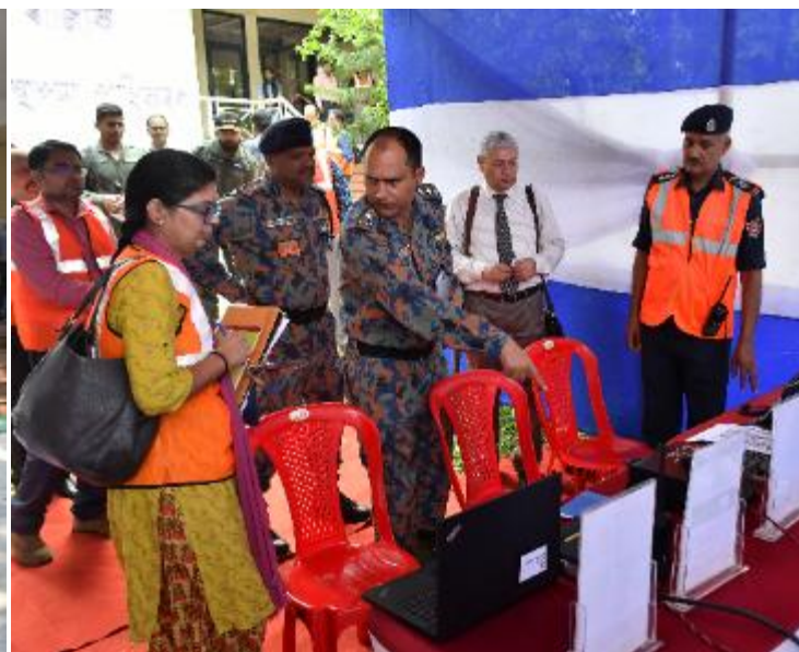
Deputy Incident Commander visited the 1st Bn. NDRF communication hub outside SEOC