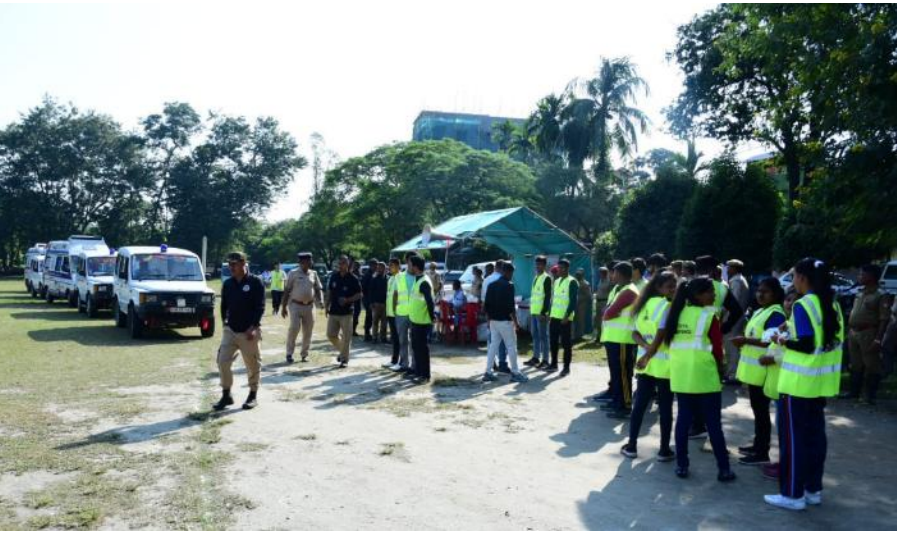
A view of Staging Area with man-material resources