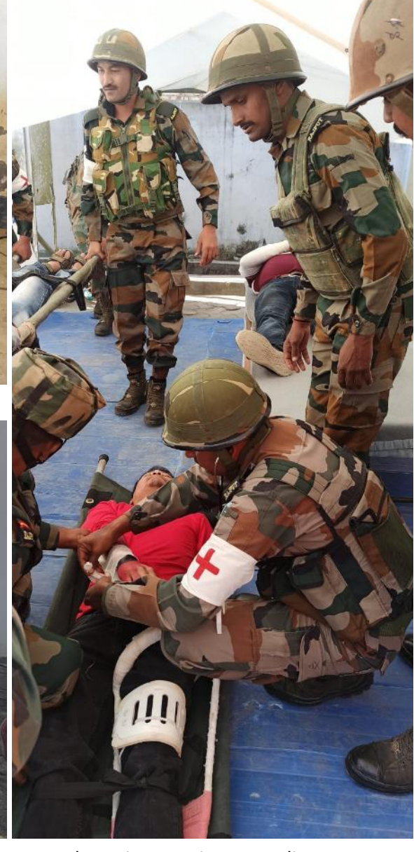
The Rajput Regiment, Indian Army, Tinsukia responding in incident site