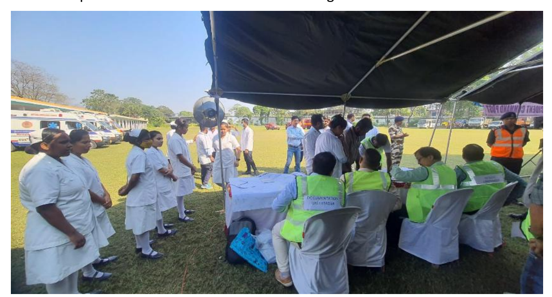
All resources Peported in Staging Area, Kokrajhar during Mock exercise